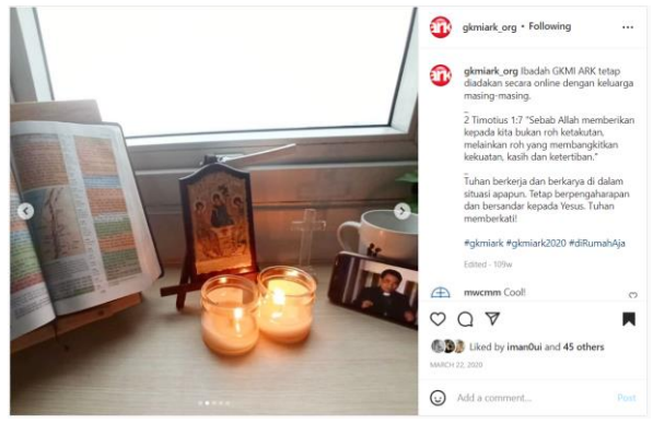
Picture 1. The social media of GKMI ARK reposting congregation members' photos of doing online worship at home

In the early days of online worship services, some congregations shared photos while attending online services with their families. There are also those who share photos of the table where the cellphone and laptop are placed, complete with flower accessories and candles. Some photos were reposted on church's Instagram account.