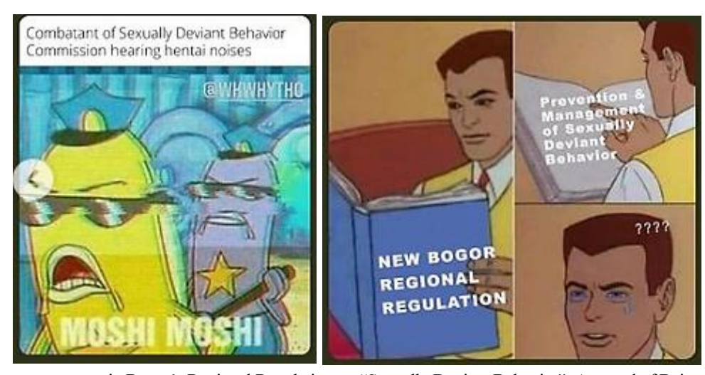
Figure 2. Humorous memes in Bogor's Regional Regulation on "Sexually Deviant Behavior": Accused of Being Discriminatory towards the LGBT Community (2022a)