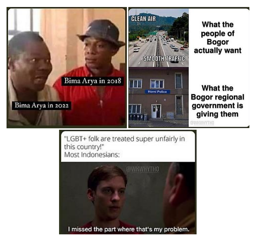
Figure 4. Serious memes in Bogor's Regional Regulation on "Sexually Deviant Behavior": Accused of Being Discriminatory towards the LGBT Community (2022a)

(horny) police," or a force that regulates people's sex lives, which they are given. By comparing initiatives to face climate change with something that regulates people's sex lives, WIUI ridicules the regulation by making it seem unnecessary and unserious. However, it needs to be noted that the term "horni (horny) police" overgeneralizes the regulation and thus strays from the issue of discrimination towards the LGBT community. This meme can also be interpreted as an act of resistance, deliberately shifting the gaze from the LGBT (the object of the surveillance or the policing gaze), to the police itself by sexualizing the police. Regardless of that, this meme still shifts the focus away from LGBT discrimination. Lastly, the third meme, unlike the previous two, criticizes the majority of Indonesians instead of the government. The third meme provides satirical text about how most Indonesians react to the fact that the LGBT community in Indonesia faces unfair treatment and discrimination as context, along with a picture of Tobey Maguire in the Spiderman movie saying, "I missed the part where that's my problem." With this meme, WIUI criticizes how discrimination against the LGBT community is overlooked by the majority of Indonesian citizens.