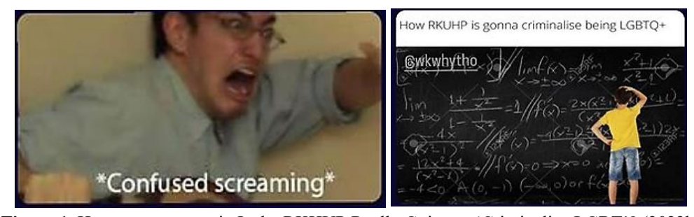
Figure 1. Humorous memes in Is the RKHUP Really Going to 'Criminalize LGBT'? (2022b)

Unlike the first post, the humorous memes in the Bogor's Regional Regulation on "Sexually Deviant Behavior": Accused of Being Discriminatory towards the LGBT Community (2022a) post are more complex. The memes